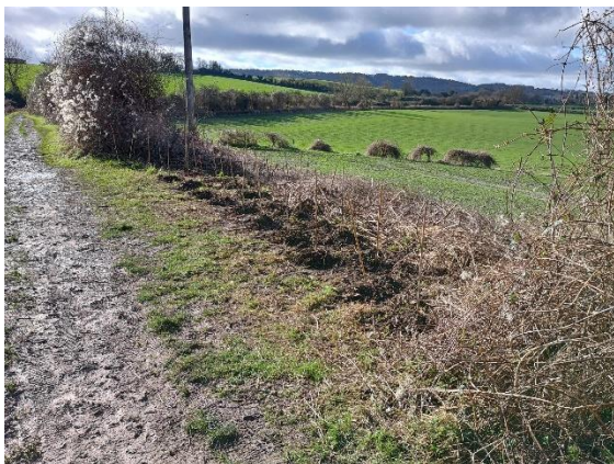
Trees planted at Bridge 4a.

The remaining trees and hedging whips were planted to fill a gap in the hedge along the towpath at Bridge 4a and to create a hedge along the site fence in the compound at Little Tring. All whips were given a dressing of woodchip mulch.