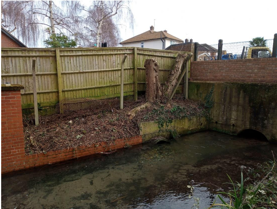
Offside of Wharf Road compound with the vegetation cleared.

The vegetation was cleared from the offside of the Wharf Road compound and returned to the site area at Little Tring.