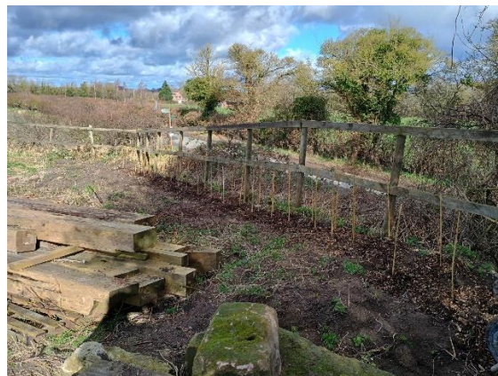
Hedge along the fence in the compound.

Some overhanging vegetation was cut back from the side of the footpath on the offside at Bridge 4. The arisings were disposed into the gap in the hedge.