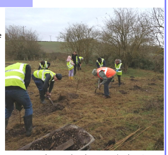
Scouts (and parents) planting trees.

A second Tidy Friday event was held on 15<sup>th</sup> December and was spent planting more trees in the triangle area.