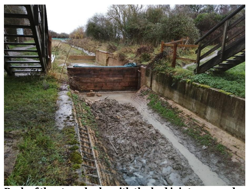
Back of the stop planks with the bed joints exposed.

The sealant in the wall joints was chiselled out so that a full inspection could be made.