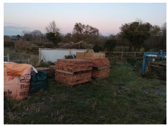
Bricks stored in compound

There was a general tidy up of the compound area with rubbish removed from site in a builders skip.