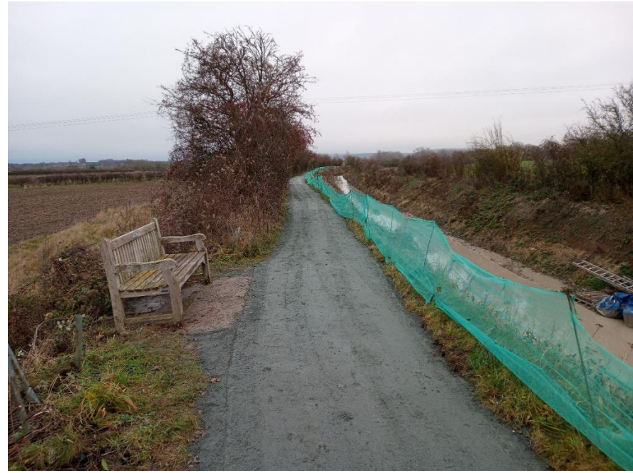
Finished section of towpath.

Surplus Type 1 has been bagged-up and stored on site.