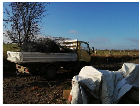
Cabstar loaded with scrap metal.