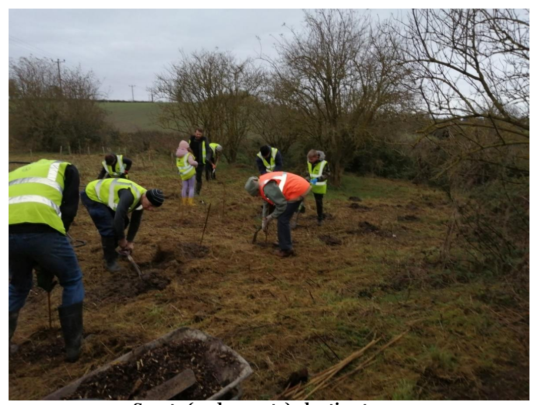
Scouts (and parents) planting trees.

On Sunday 26th November Scouts helped plant 210 trees.