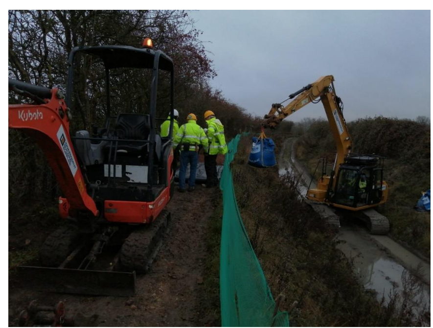
Lifting Type 1 to the towpath.

The bags were lifted to the towpath and slit open to allow the Type 1 to be discharged. Spreading the Type 1 was done using spades and rakes. The Type 1 was laid in two layers. Each stone layer was compacted using a pedestrian drum roller.