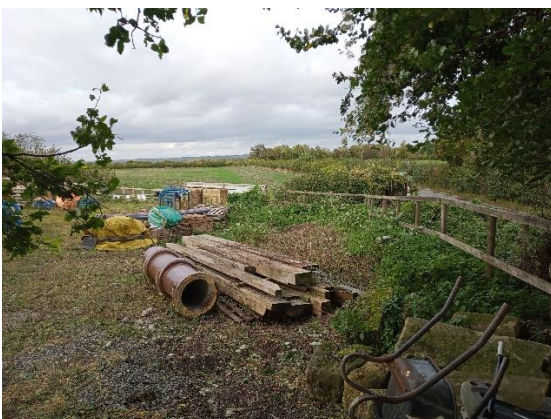
Site compound after tidying.

The site compound was tidied and the remaining vegetation cut back. The pile of wood chippings was bagged. The water containers were moved and the area levelled. Holes made by bottlers in the tip were filled with tip material.