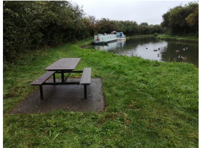
Final picnic table