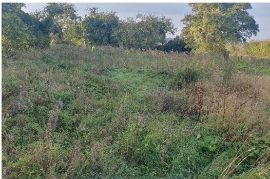
Whitehouses meadow, before

An extra work party day was held on Tuesday 17 th October. The grass was cut at the meadow at Whitehouses with the arisings being raked up and piled off the meadow.