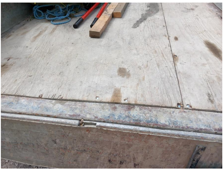
Timber boards secured.

Repairs were carried out to the WCT pick-up to secure the timber boards.