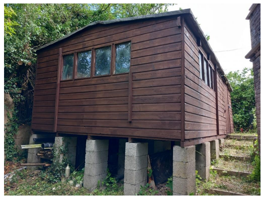
Newly treated timber shed.

The shed was given a coat of wood preservative.