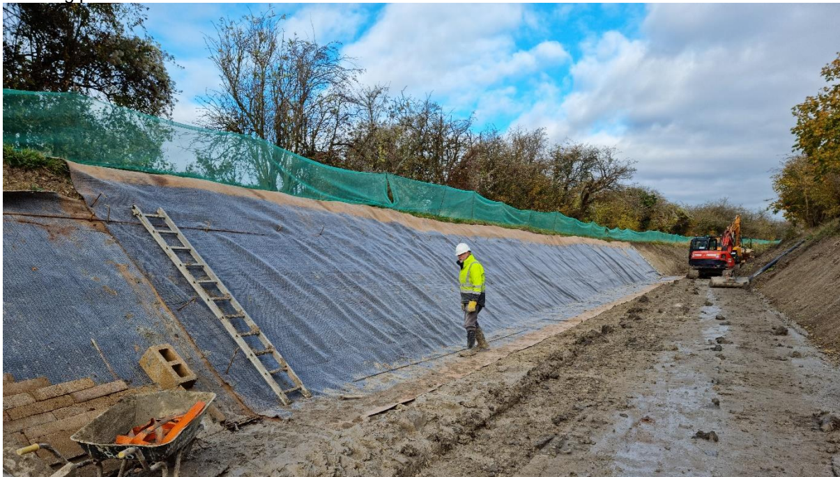
40m Bentomat roll laid. Steel rods & hammering pins home still to be completed.