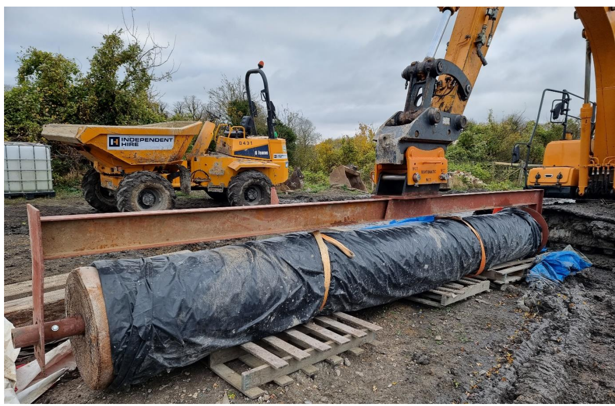
Bentomat dispenser. Note quick-hitch adapter plate and securing bolt under top bracket (on left).