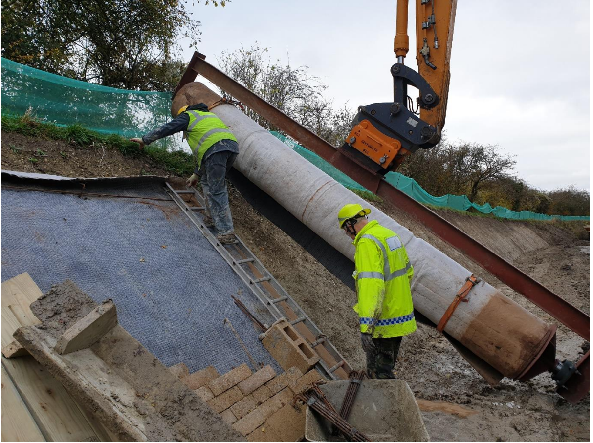
Bentomat dispenser in laying position.