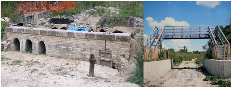
The restored wharf wall (2012) and, 2006, one of the new footbridges (4)