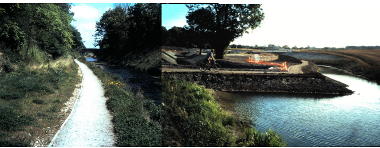
Restoration complete between Drayton Beauchamp (5) and the new A41 (6)