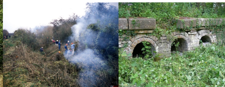
Whitehouses (3) – scrub clearing