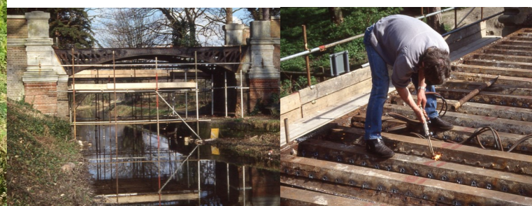
Rothschild Bridge (9) saved from demolition and under repair (1992)