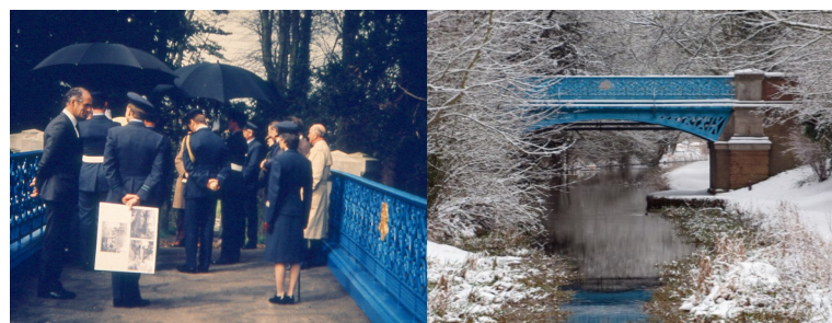
Reopened with ceremony