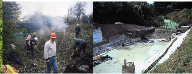
At Drayton Beauchamp (5) in the 'dry'