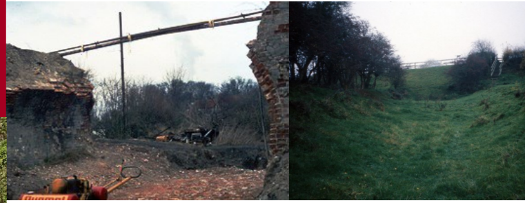
Little Tring Bridge (1) – going