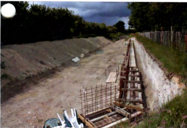
Phase 2 Stage 2 mooring bay base walls almost complete