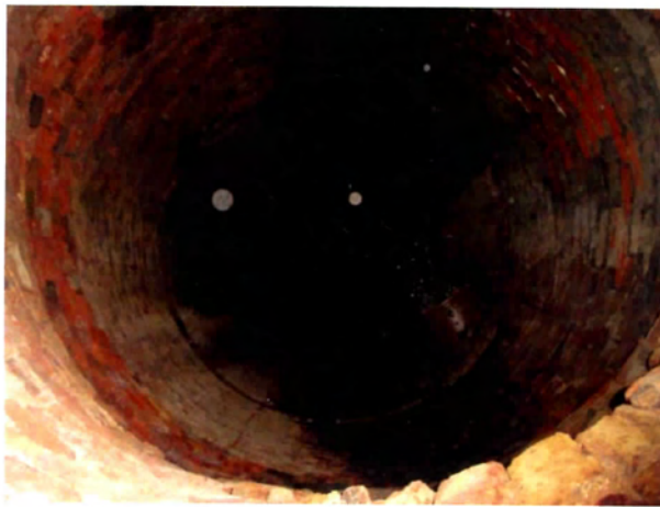
Looking down the pumping shaft at Whitehouses