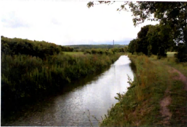
Phase 2 Stage 1 is looking well bedded in with the new spring growth