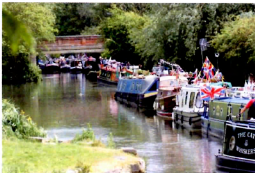
Front cover—decorated boats moored on the Grand Union at the Boxmoor Festival