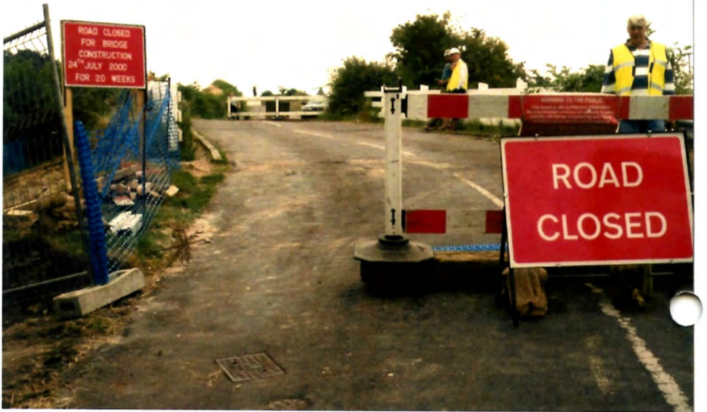
Above - road closed for rebuilding Little Tring Bridge 24th July 2000 Below - Official opening of phase 1 28th March 2005