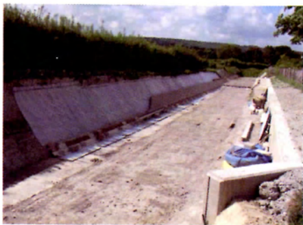
Completed works at Drayton Beauchamp after the Festival working party

At the Festival we were able to treat the weeds at Whitehouses to stop further growth and strim the front. We were not able to strim any further thanks to the thieves who raided our store at Tringford and stole the strimmer.