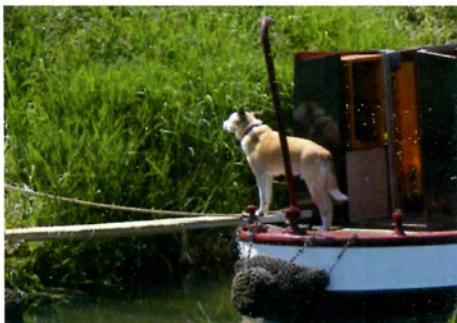
Can't we get any closer?

Sunday proved to be a similarly busy, so much so that the planned Steam Traction Engine procession had to be cancelled – there were simply too many people around for safety.