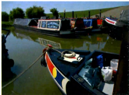
... there were 129 boats at the event