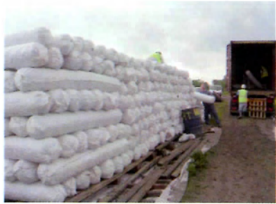
Rolls unloaded and stacked