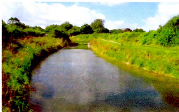
The dramatic result of the work supported by BLOCKAID

It is the intention to distribute the leaflets more widely in due course, and this is just the first step.