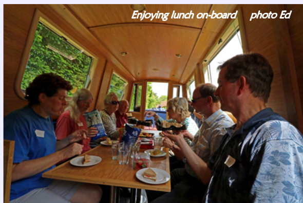
Enjoying lunch on-board