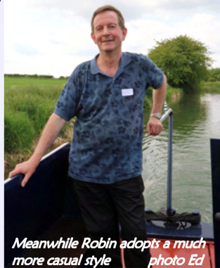
Meanwhile Robin adopts a much more casual style