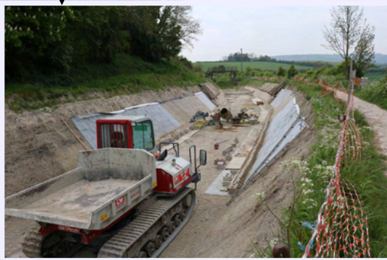
'The wet' returned in March