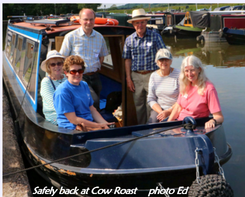
Safely back at Cow Roast