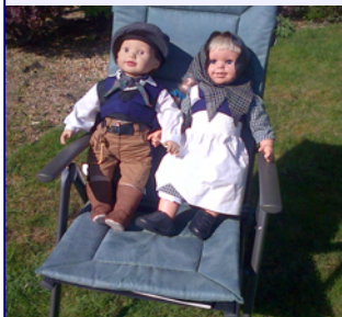
And Rosie and Jim came too.

We would like to wish them every success with their bid to get Lottery Funding.