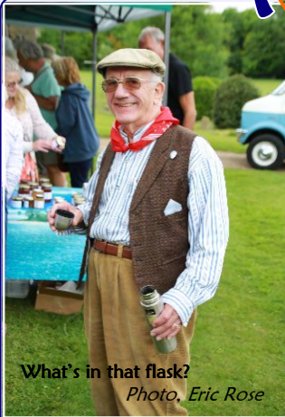
What's in that flask?