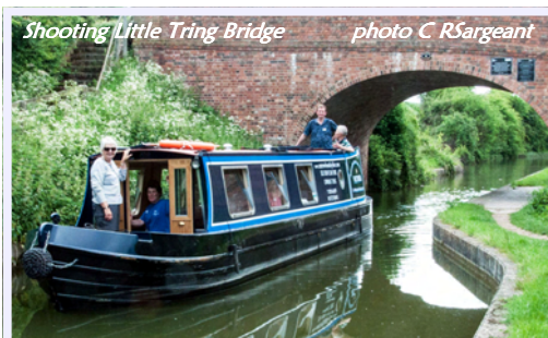
Shooting Little Tring Bridge

Only disappointment was that we saw but one kingfisher in Tring Cutting.