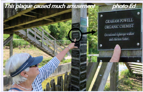
This plaque caused much amusement