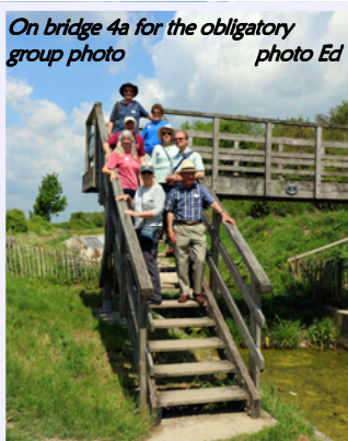
On bridge 4a for the obligatory group photo