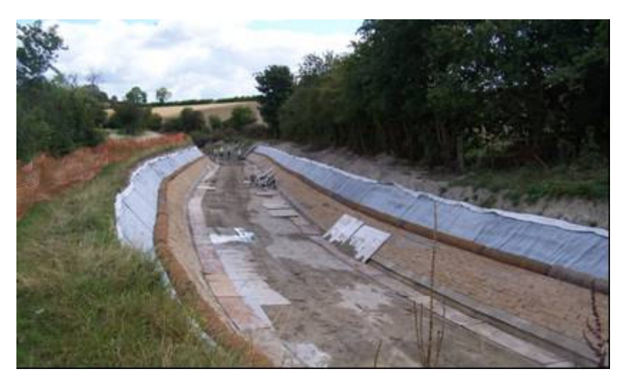
The banks lined with bentomat and the concrete blocks and coir rolls in position

flowing from Wendover to Drayton Beauchamp as the plant life is choking the water flow, whereas the regular passage of boats keeps a clear channel with much less harm to wildlife than intermittent reed cutting.