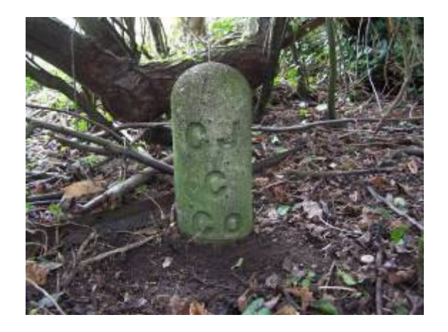
Grand Junction Canal Company boundary marker post found in front of the boundary fence at the back of Whitehouses