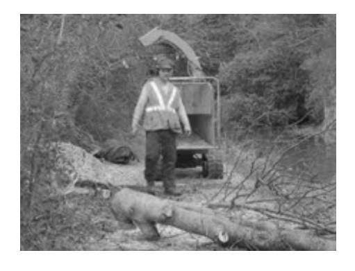
BW Operatives lopping and topping on the Wendover Arm

Towpath maintenance by BW involving the trimming of trees has been carried out in several locations including our own Wendover Arm. It has not met with universal approval, there have been widely publicised objections to the way the pruning has been carried out in some areas.