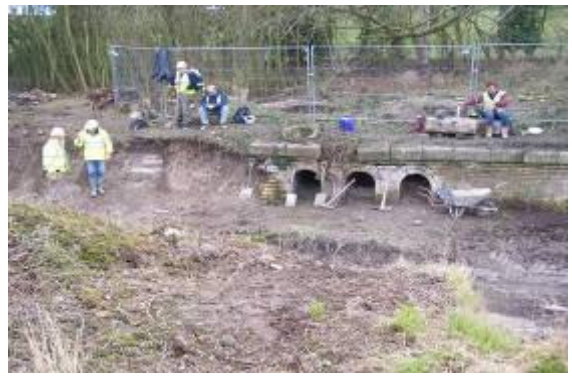
Despite all their hard work at Whitehouses the team did have time for a lunch break!