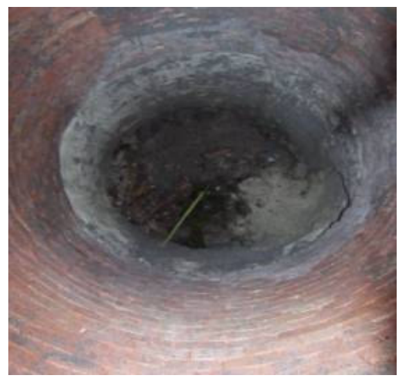
View down the well at Whitehouses