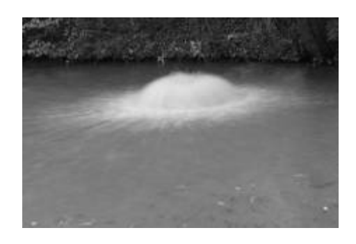
An aerator in action on the Aylesbury Arm

Closer to the town it was necessary to dredge the bottom pound including the basin area. The usual bicycles and shopping trolleys were removed (why do people always chuck them in?) This work inevitably disturbs the bottom and causes the water to become saturated with solids thus reducing its oxygen content and making it a hazardous place for the fish. To mitigate an aerator was employed but there were still a number of dead fish in evidence although they were quickly removed by BW operatives.