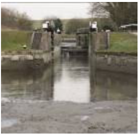
The dry section of the Grand Union canal on Marsworth flight approaching the Tring Summit

The details of the sponsorship are as follows: