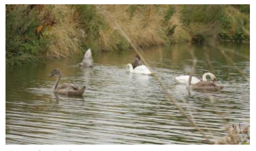
A busy family of swans has now taken up residence on the newly restored section close to Drayton Beauchamp at