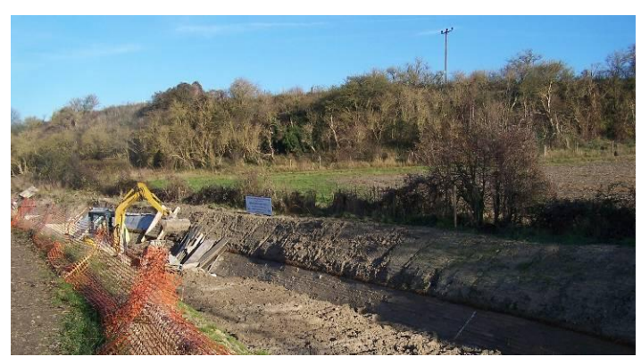
THE END OF STAGE 2 IS THE BUSH ON THE OFFSIDE WITH MARKER POST IN FRONT

As you are already aware we are leaving the next rewatering until the re-lining reaches Bridge 4A as it will be easier to construct the next bund in the bridge narrows although care will have to be taken so that a dredger can remove the bund in future whilst working clear of the bridge span.