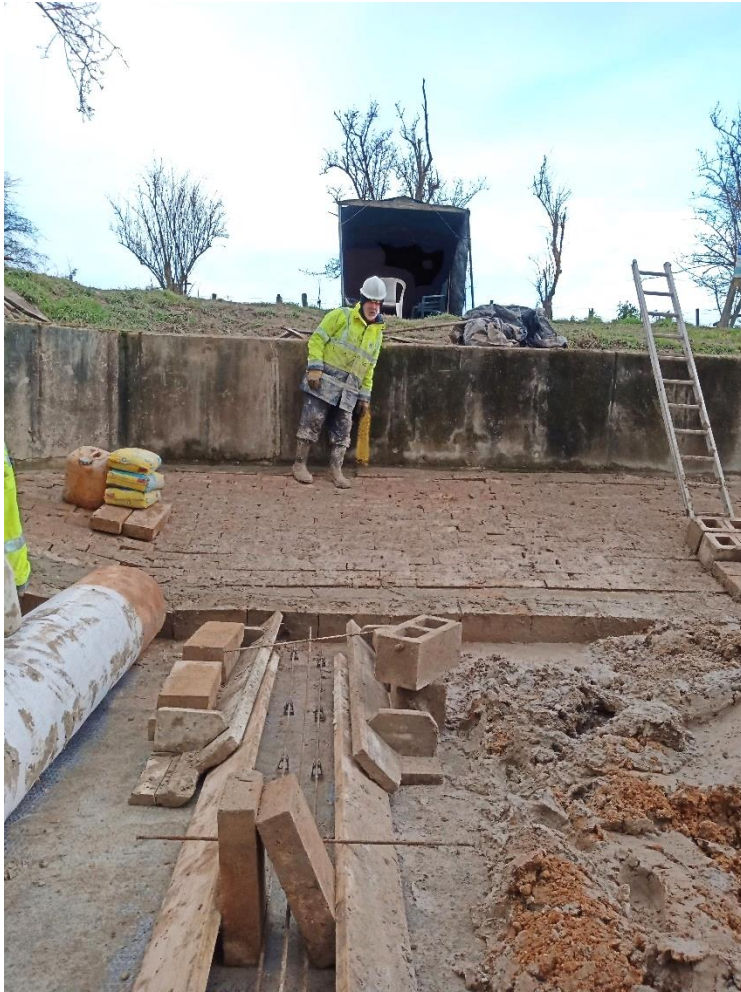
Here we have an “Inspector of Policemen” making sure number 7 is in the correct position.

The main activity was centred on finishing the block work at the Mooring wall and the last piece on the towpath side. The last reinforced concrete sleeping policeman was cast in place, bringing the total to 7.