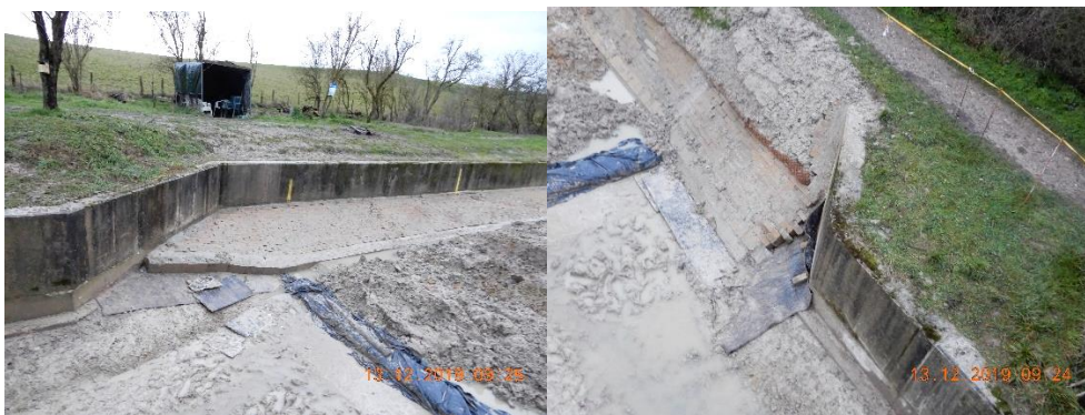
The ends of the mooring wall blocks and the Towpath bank.

Following on from this the bed mat was rolled out, the main roll cut off and lifted away and the remaining “spare” bed mat carefully folded back for future use.